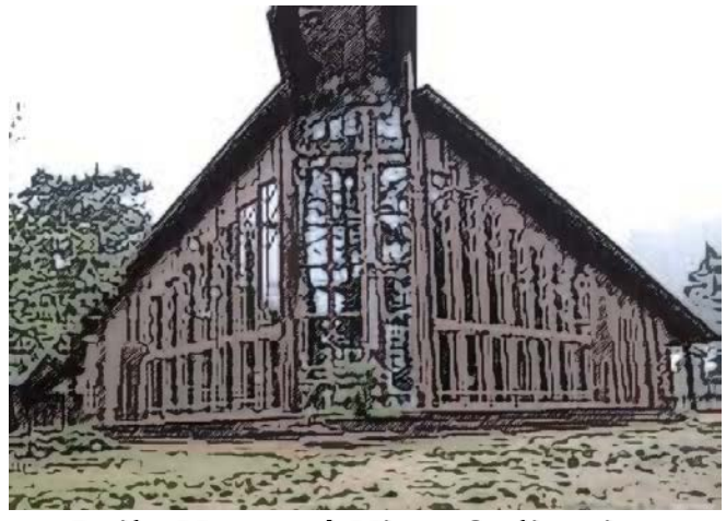
Daily Masses / Misas Ordinarias

9:00 a.m. (English) Point Arena <u>Stream alive</u>